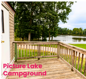
Picture Lake Campground