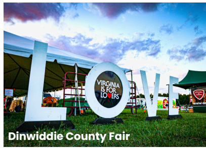
Dinwiddie County Fair

Yellow Gate Place LLC: 10306 Boydton Plank Rd., 23841