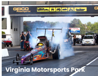
Virginia Motorsports Park