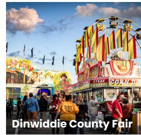
Dinwiddie County Fair