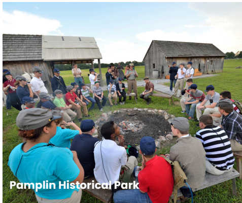
Pamplin Historical Park