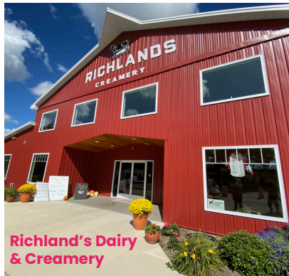
Richland's Dairy & Creamery