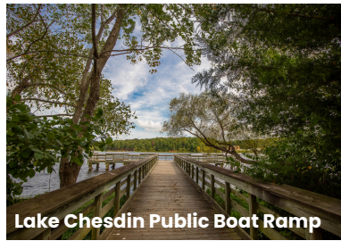
Lake Chesdin Public Boat Ramp