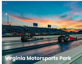
Virginia Motorsports Park