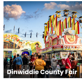
Dinwiddie County Fair