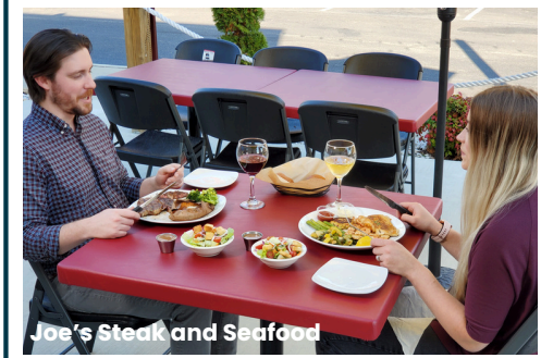
Joe's Steak and Seafood